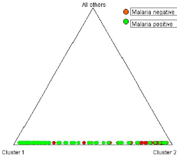
Figure 1 Triangle plot showing estimates of membership coefficient (Q) for each individual by sampled groups, analysed under admixture model, assuming correlated allele frequencies.