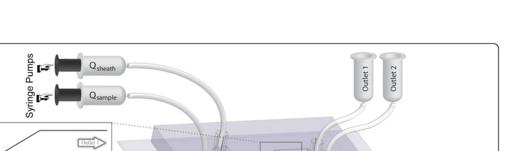
Figure 1 Experimental setup. The sheath flow Q_{\text{sheath}} and the sample flow Q_{\text{sample}} are driven by two separate syringe pumps. They are connected to the PDMS microchannel via PTFE tubes. The microchannel has a width w = 91 \mu \text{m} in y-direction for the whole device. The sample and the sheath flow inlet have a height h = 102 \mu \text{m} (in z-direction). The separation process occurs in the 20 mm long separation channel (height h = 102 \mu \text{m} ) before the microchannel gently widens over a distance x = 400 \mu \text{m} to h = 301 \mu \text{m} . The bifurcation between outlet 1 and outlet 2 is at z = 50 \mu \text{m} and outlet 2 is connected at an angle of 49°. Both outlets have a height of h = 250 \mu \text{m} . The injected cells are focused to the lower wall before they flow through the separation channel and experience the non-inertial lift effect. The expansion shown in the inset increases the absolute height differences which facilitates sorting. Finally, the cells are collected in the height reservoirs connected to outlet 1 (waste) and outlet 2 (enriched sample). We observe the process using an inverted video microscope.

facilitates sorting into outlet 1 or outlet 2 ( h = 250 \mu m ) which bifurcate 50 \mu m above the lower wall at an angle of 49°. The final height of the cell stream is adjusted by aligning the height reservoirs independently.