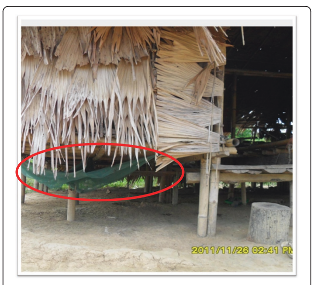
Figure 3 Misuse of the bed net for animal was observed in one of household visit.

Universal coverage remains the goal for all people at risk of malaria especially in migrant plantation workers. Free distribution of the ITN/LLINs is crucial to the success of maintaining universal coverage of bed nets in Myanmar. To further improve coverage and effective utilization of ITN/LLINs among migrant workers, regularly updated, interactive, comprehensive national advocacy, IEC/BCC activities, and operations research feeding into and provid-